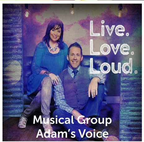
Musical Group Adam's Voice

FRIDAY Cake Reception Celebrating 75yrs following evening service.